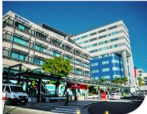
Royal Brisbane and Women's Hospital