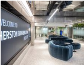
Herston Biofabrication Institute